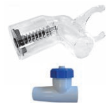
Vacuum gauge and regulator valve